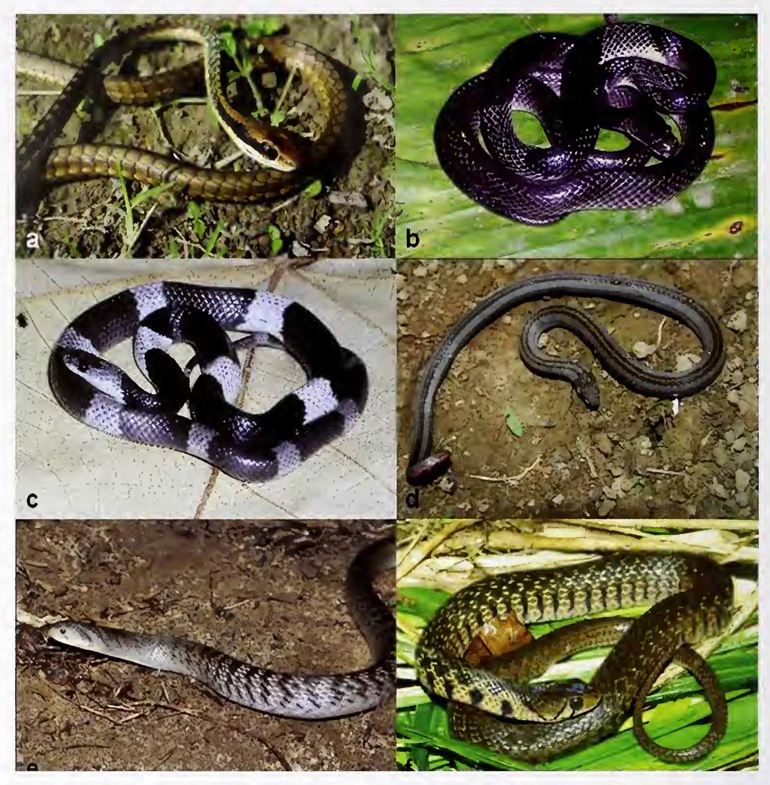
Fig. 3. a. Dendrelaphis ngansonensis (ZFMK 88913); b. Lycodon subcinctus (adult, IEBR A.2010.42); c. Lycodon subcinctus (juvenile, ZFMK 91899); d. Oligodon deuvei(ZMMU NAP-02811); e. Oligodon ocellatus from Cat Tien National Park, Dong Nai Province (e); f. Xenochrophis flavipunctatuss (ZFMK 88914).